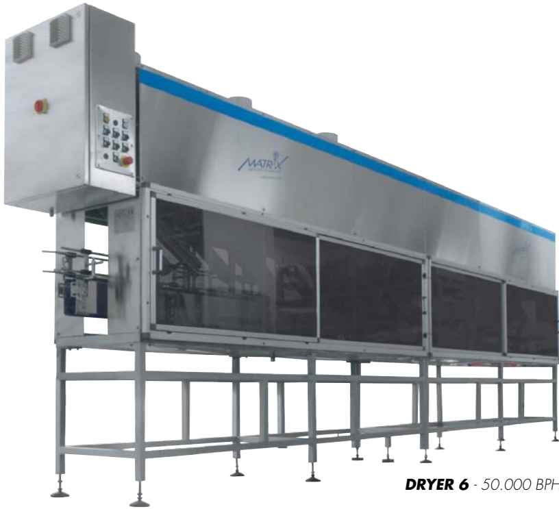
DRYER 6 - 50.000 BPH