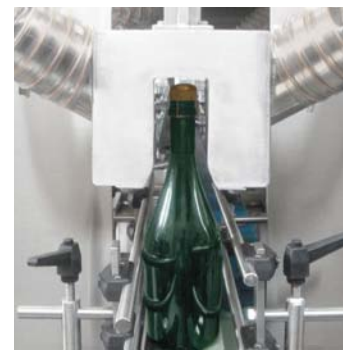
Bottle Neck Dryer.