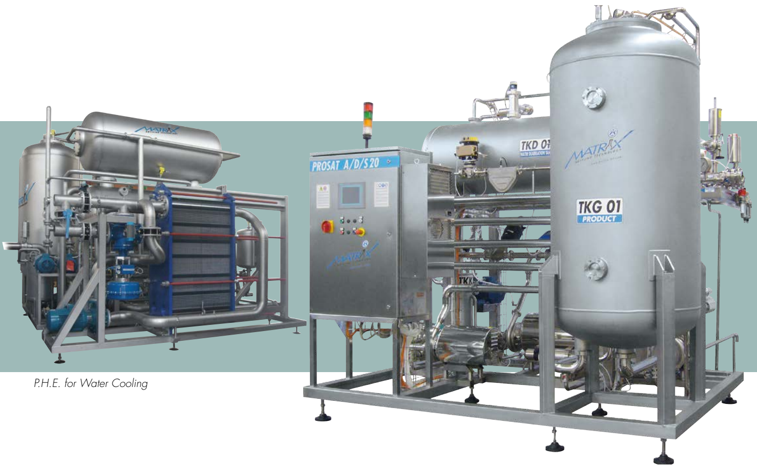
P.H.E. for Water Cooling